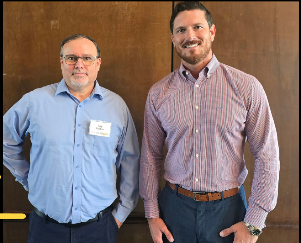
Topic: Standards and tools for selecting chemical Protective Clothing